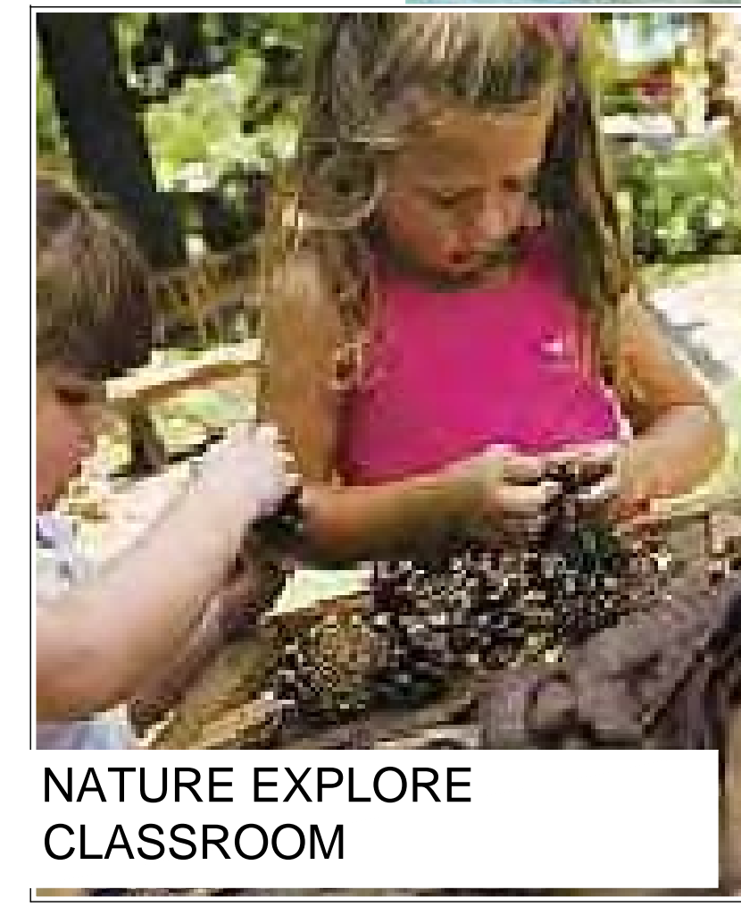
NATURE EXPLORE CLASSROOM